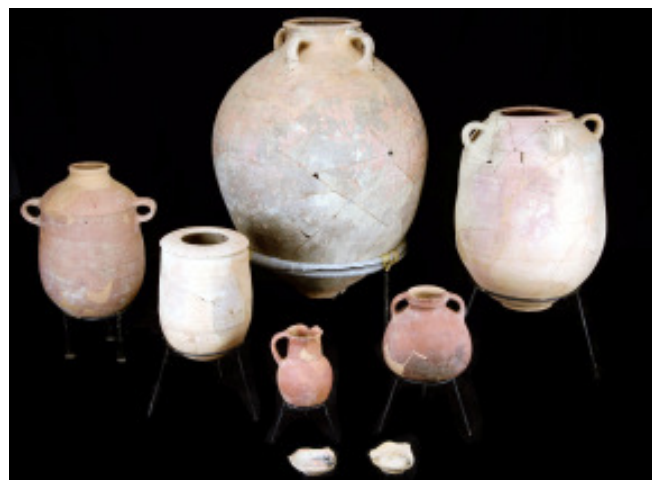
The same pottery vessels after reconstruction.

The skeptics had convinced so many that the Bible was only imaginary fiction that the stupendous results of this new discipline that came pouring back from the Holy Land rocked the world. Because, it is all there, exactly as the Bible says, exactly where it should be.