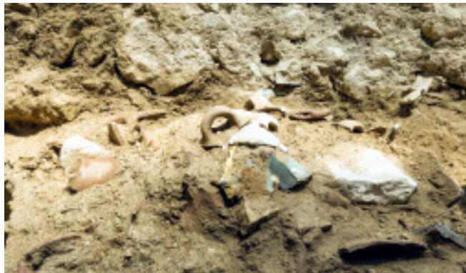
Pottery vessels in situ , Latin for “in place,” as they were found in a room destroyed by an earthquake in Jerusalem, which was dated using Biblical references to the reign of King Uzziah (792-740 B.C.).

It was from these efforts that a new discipline emerged—and a newly adopted English word was used to describe it: “archaeology,” from the Greek arkhaiologia , a compound of arkhaios , meaning “ancient,” and logos , meaning “words, study,” so literally archaeology is “words about and study of ancient things.”