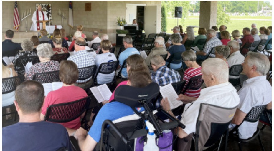
A large congregation enjoyed our annual Service in the Shelter House to observe Independence Day on July 4. More photos online at www.trinitylcms.org/photos .