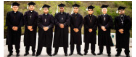
Last May eight men were in the first graduating class of Concordia Seminary in the Dominican Republic.

Also in attendance were representatives from the LCMS International Center, Concordia Theological Seminary Fort Wayne, and Concordia Seminary St. Louis. The standing room only event included theological presentations centered around a theme very appropriate for many Latin American nations: "The Consolation of God's People in the Midst of Suffering."