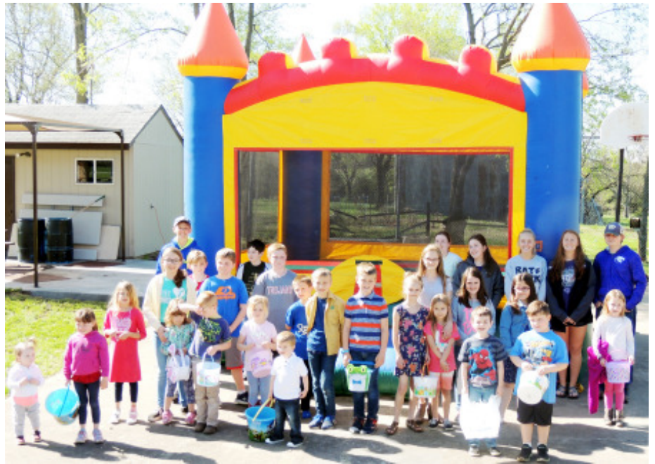
Our thanks to Twin Valley 4H for again sponsoring the annual Easter Egg Hunt at our Shelter House on April 20. Lots more pictures are in the Photo Gallery on our church web site at www.trinitylcms.org/photos .