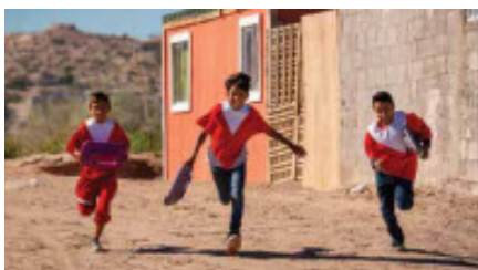
Excited boys racing to the special service where they will be baptized.

Communities like Anapra, on the edge of Juárez, Mexico, sprung up rapidly when American corporations built manufacturing facilities in Mexican border town. Filled with hope at the promise of good jobs, Mexican families relocated from every corner of the country, rapidly expanding the population of sleepy, old border towns. Built with salvaged materials, the humble homes have only recently begun to receive basic services such as power, water and paved roads.