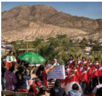
The group being baptized (in robes on the right) was so large that the service was held outdoors.