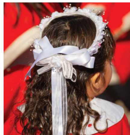
A little Mexican girl wears a braided crown to celebrate her Baptism.