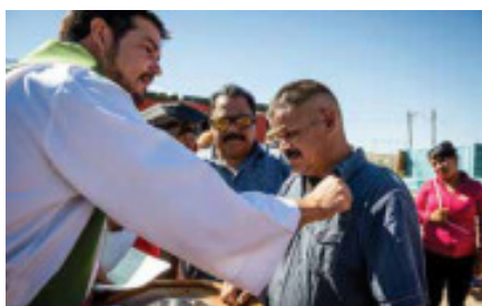
Many adults were also baptized, including parents of the baptized children—entire families born again!

Ten months later, two lines formed in front of the baptismal fonts with the crowd pressing close around. They were eager to witness the eternal miracles taking place through water and the Word in this spot near the U.S.–Mexico border—with patrol helicopters flying overhead!