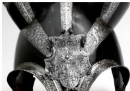
A ceremonial horse's helmet from 1553 inscribed with the Lutheran motto Verbum Domini Manet in Aeternum .

inscribed inside churches, over doorways, on foundation stones, even on horse's helmets! The VDMA logo and full statement Verbum Domini Manet in Aeternum has been used by Lutheran bodies worldwide and remains an enduring motto of the Reformation to this day.