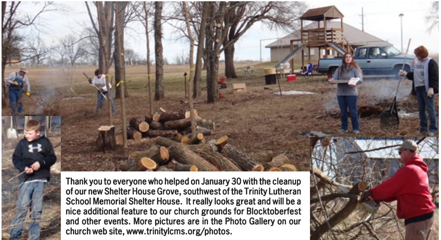
Thank you to everyone who helped on January 30 with the cleanup of our new Shelter House Grove, southwest of the Trinity Lutheran School Memorial Shelter House. It really looks great and will be a nice additional feature to our church grounds for Blocktoberfest and other events. More pictures are in the Photo Gallery on our church web site, www.trinitylcms.org/photos .