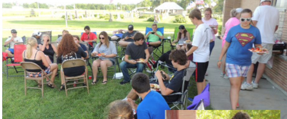
Trinity Lutheran Youth enjoyed a BBQ & both regular and water balloon volleyball on July 5 (you can just see the balloon in the air in the photo below). The event closed with taking down the cemetery flags as a service project. More photos are in the Picture Gallery on our church web site, www.trinitylcms.org/photos .