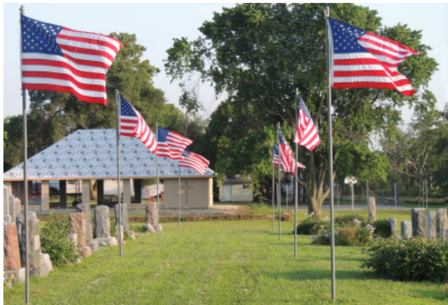
Progress on the new Trinity Lutheran Shelter House on the site of the former school building is seen through the avenue of flags displayed in the cemetery for the Fourth of July. Dedication of the Shelter House is planned to be conducted, Lord willing, at the Blocktoberfest Outdoor Service, which will be the first outdoor service held in the Shelter House, on the morning of Sunday, September 20 at 10:00am.