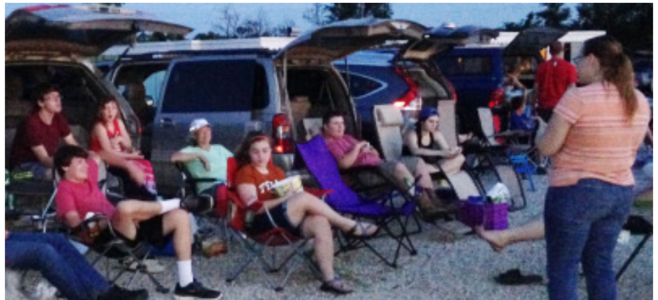
The Youth Group enjoyed movie night at the Mid-Way Drive-In Theatre on June 5.