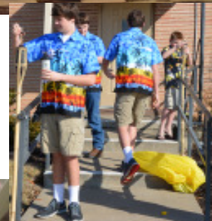
Sweetheart Dinner February 21